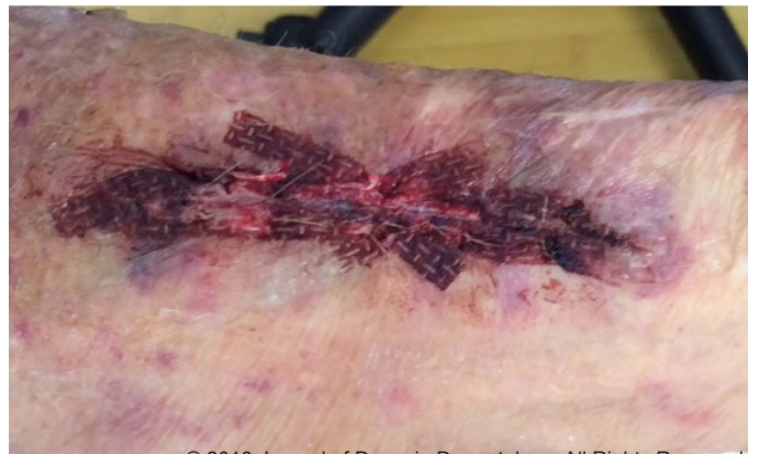
FIGURE 3. Appearance of surgical site 2 weeks after procedure.